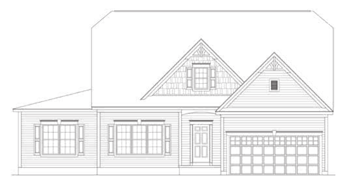
TOWN & COUNTRY