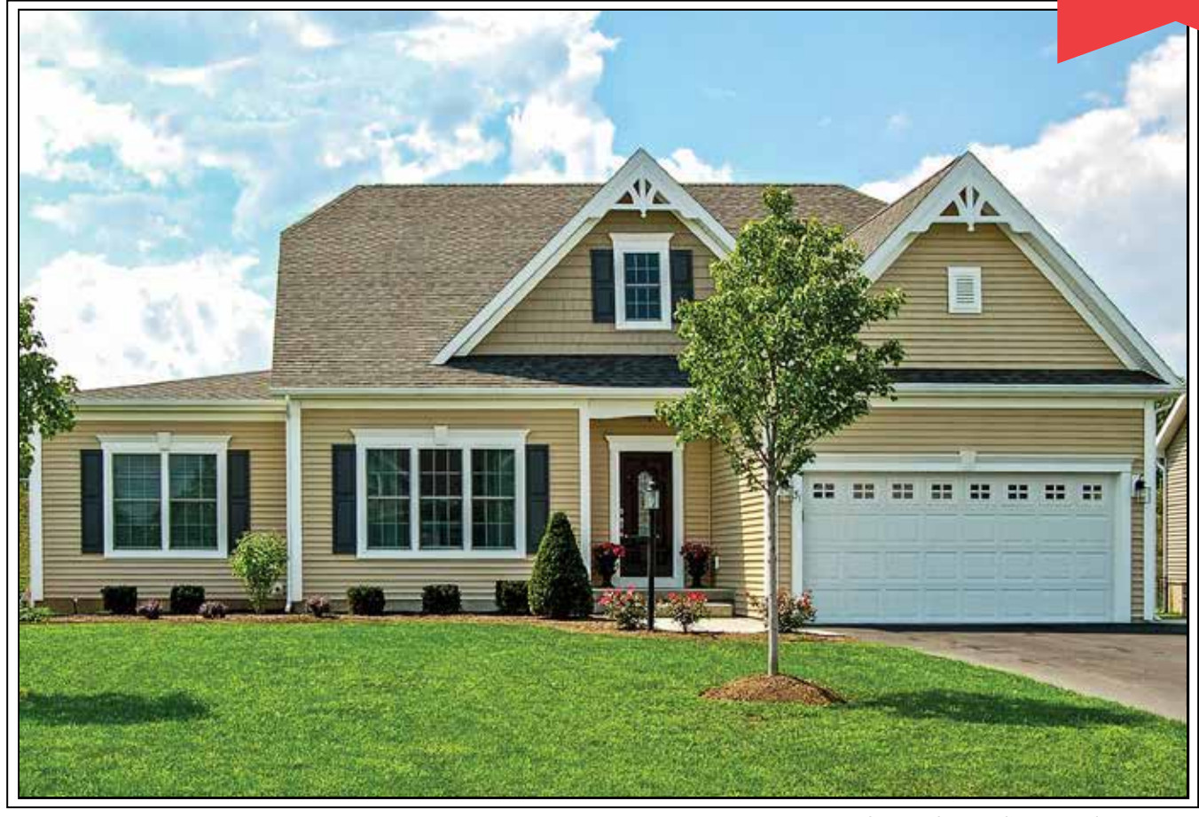
TOWN & COUNTRY elevation shown with private Multi-Gen suite.