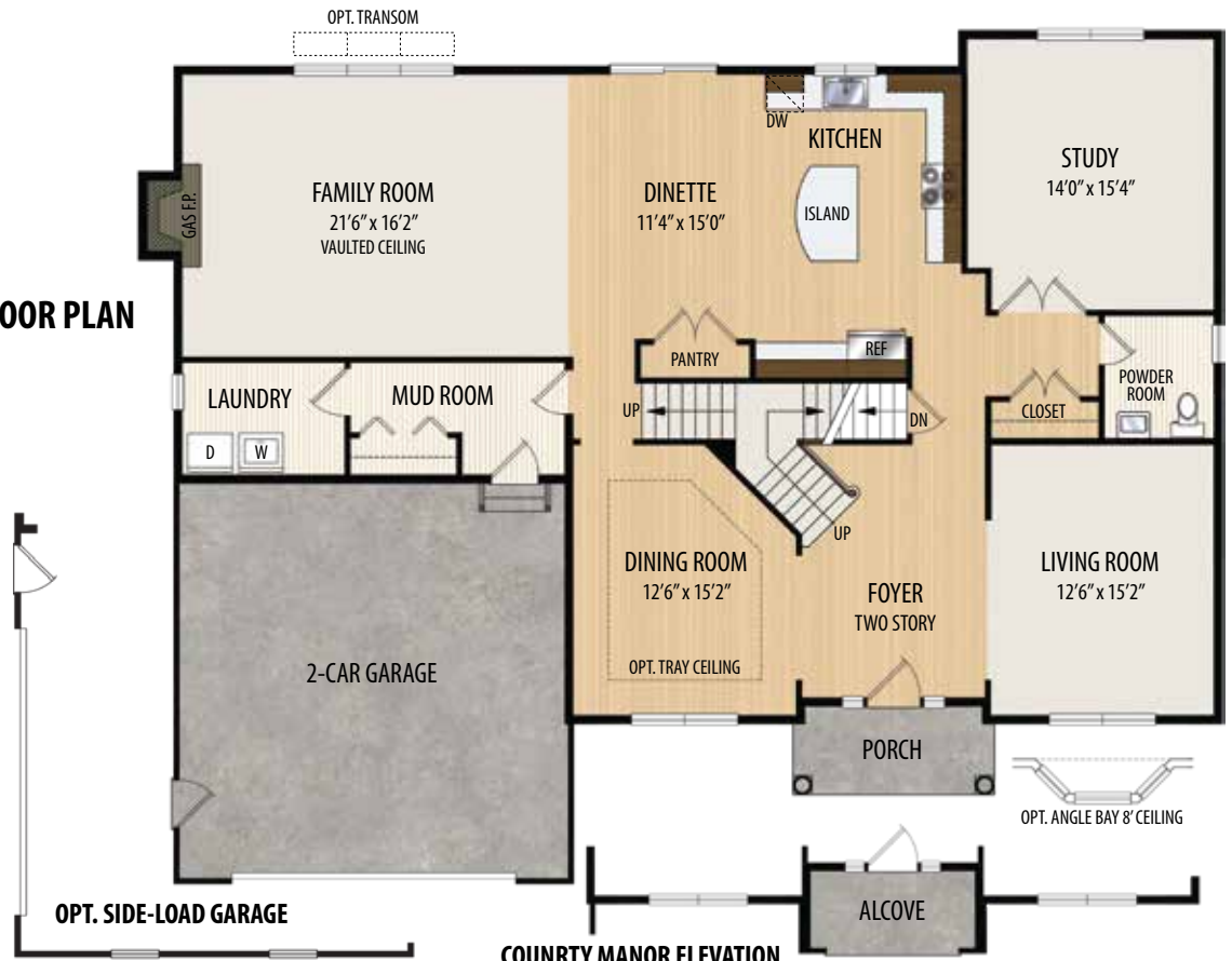
COUNTRY MANOR ELEVATION