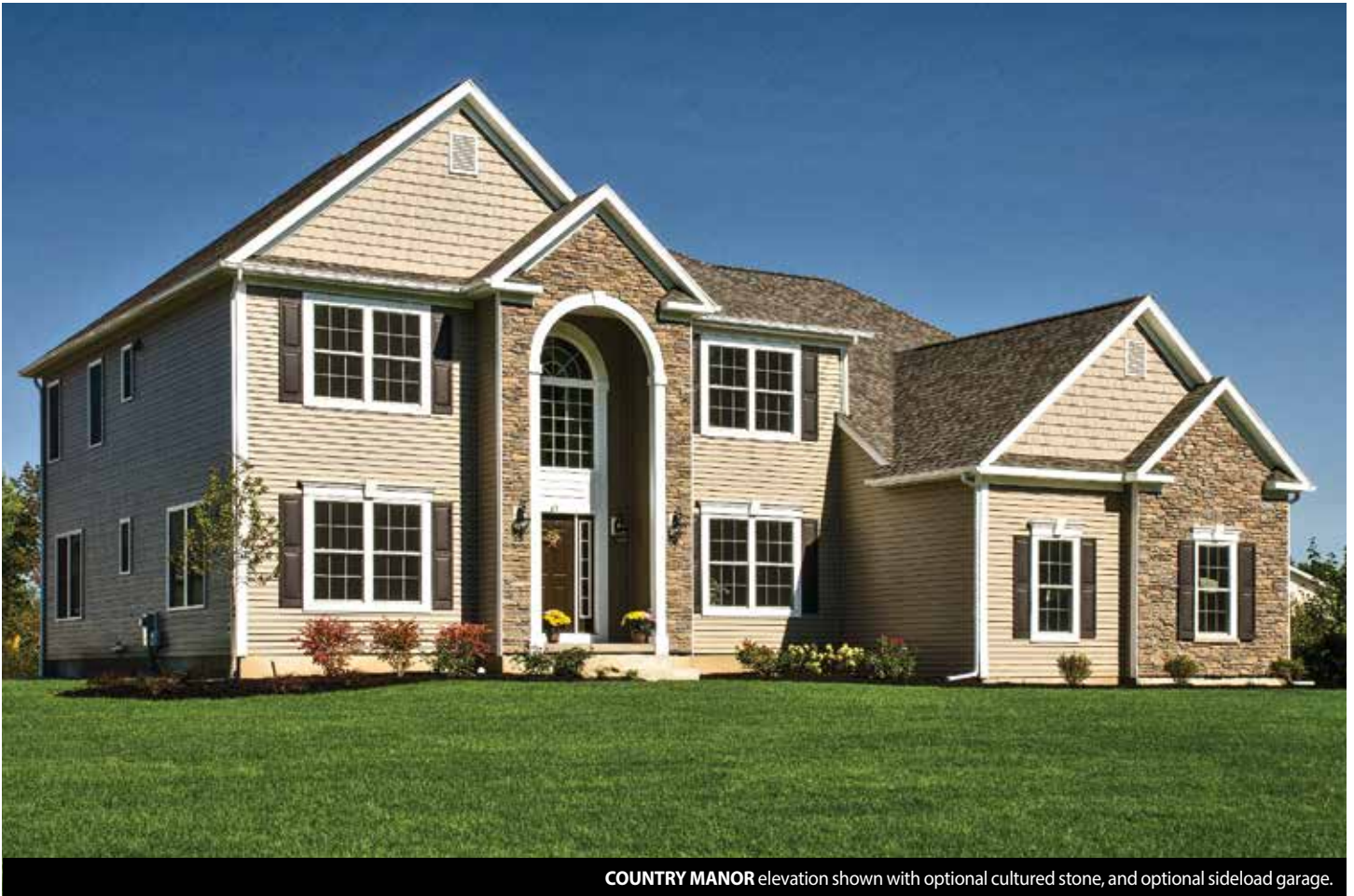
COUNTRY MANOR elevation shown with optional cultured stone, and optional side-load garage.