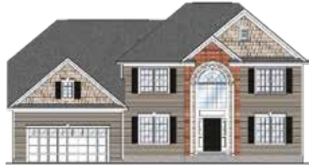
COUNTRY MANOR Shown with optional brick.