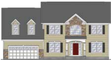
AMERICAN FARMHOUSE Shown with optional cultured stone.