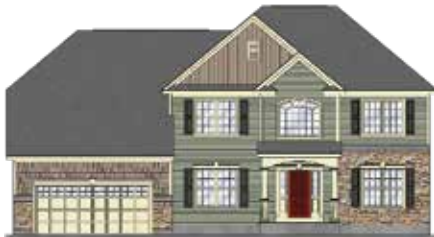
TOWN & COUNTRY Shown with optional cultured stone.