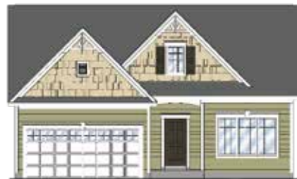
TOWN & COUNTRY