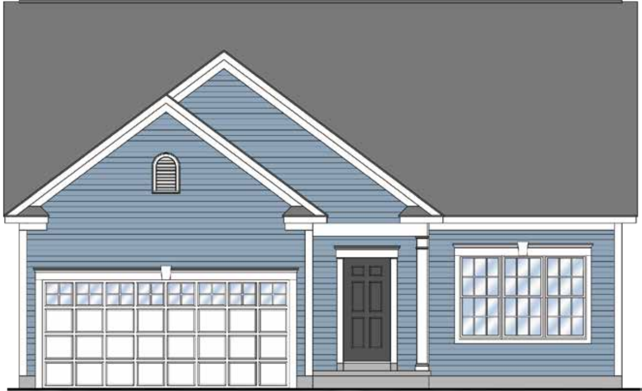
AMERICAN FARMHOUSE elevation shown.