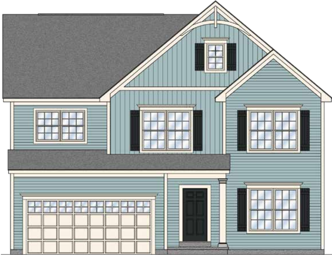
AMERICAN FARMHOUSE elevation shown.