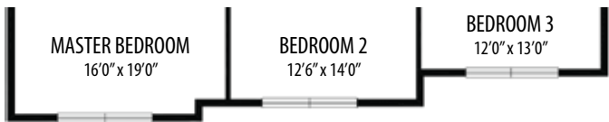
AMERICAN FARMHOUSE ELEVATION