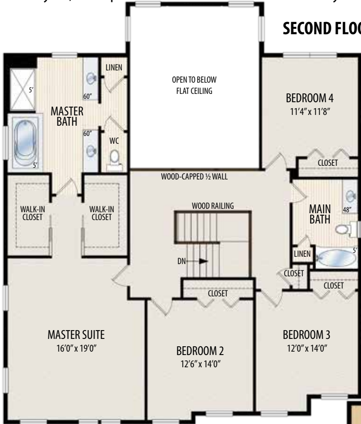
AMERICAN CRAFTSMAN ELEVATION