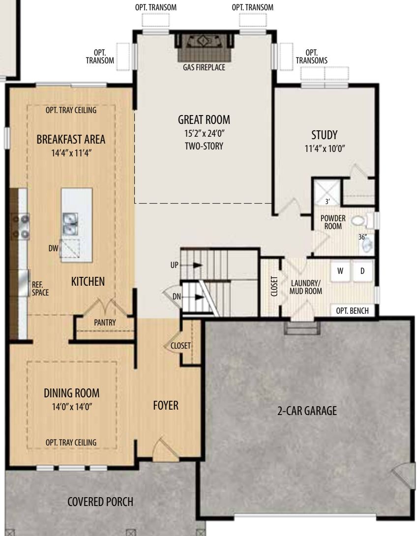
AMERICAN CRAFTSMAN ELEVATION