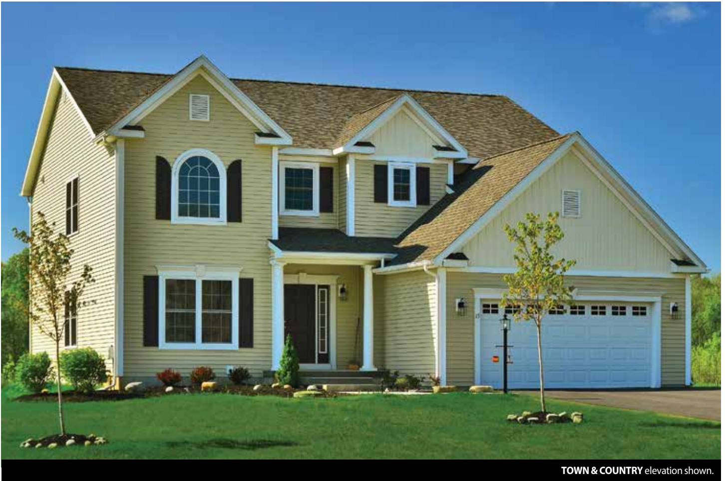
TOWN & COUNTRY elevation shown.