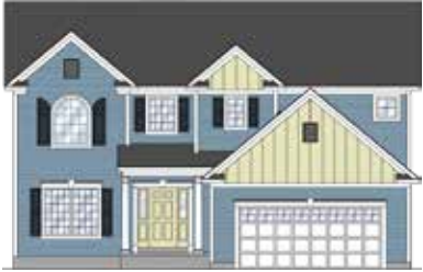
TOWN & COUNTRY