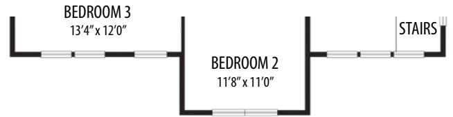
COUNTRY MANOR ELEVATION