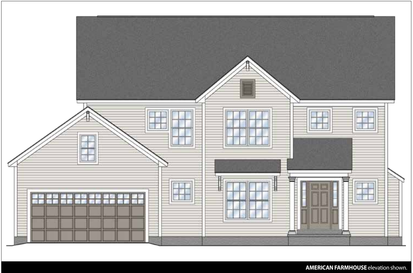
AMERICAN FARMHOUSE elevation shown.