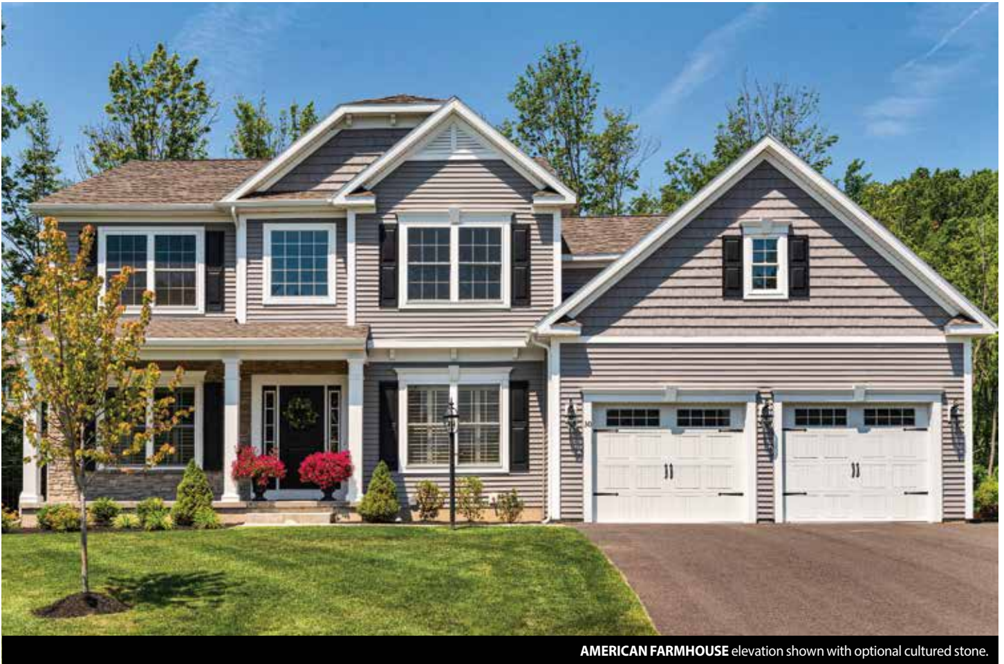
AMERICAN FARMHOUSE elevation shown with optional cultured stone.