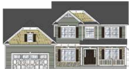
AMERICAN FARMHOUSE Shown with optional cultured stone.