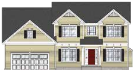
TOWN & COUNTRY