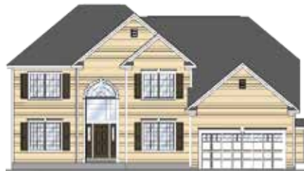
TOWN & COUNTRY Shown with optional cultured stone.