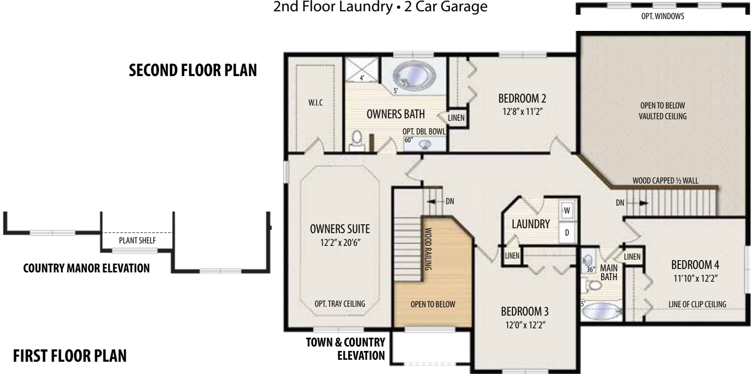
COUNTRY MANOR ELEVATION