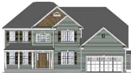
COUNTRY MANOR Shown with optional brick.