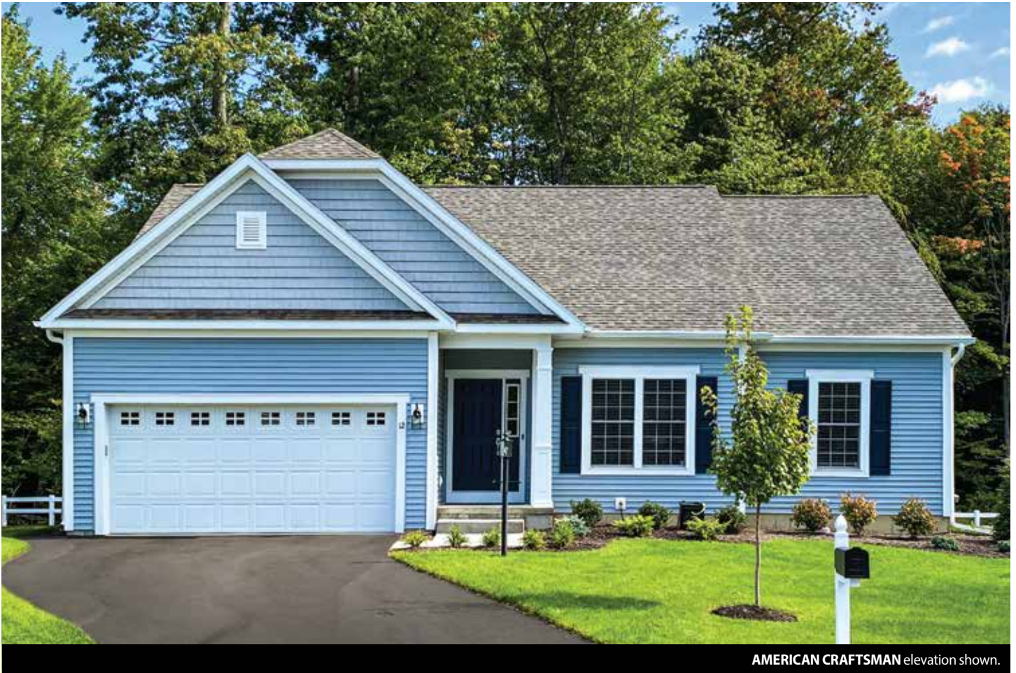
AMERICAN CRAFTSMAN elevation shown.