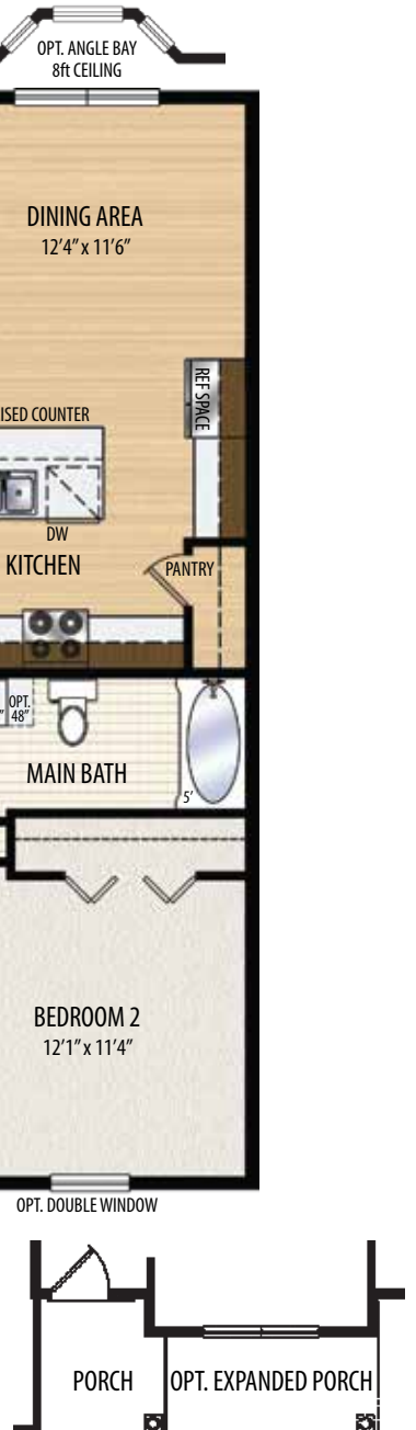
AMERICAN CRAFTSMAN ELEVATION