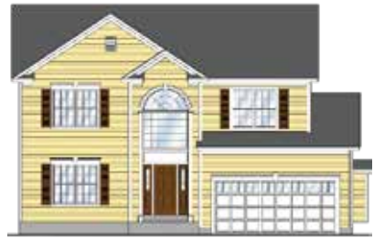
TOWN & COUNTRY