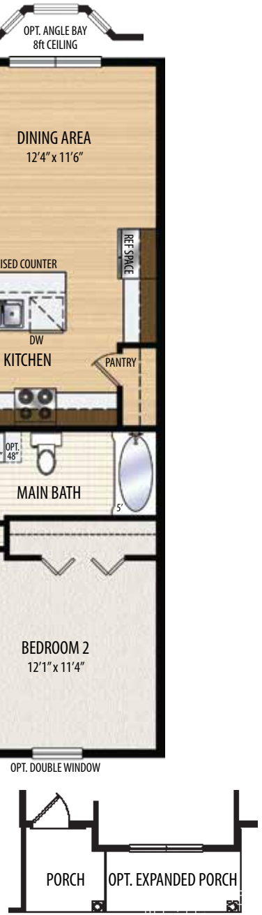
AMERICAN CRAFTSMAN ELEVATION