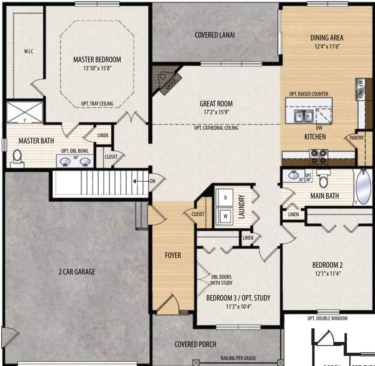
AMERICAN FARMHOUSE and TOWN & COUNTRY ELEVATION