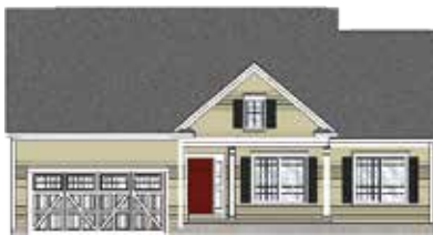
TOWN & COUNTRY