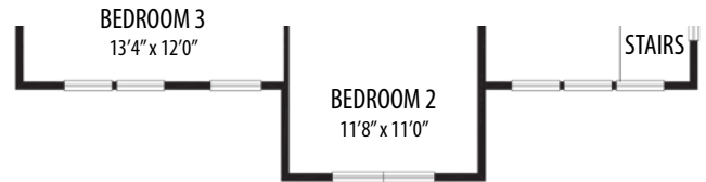
COUNTRY MANOR ELEVATION