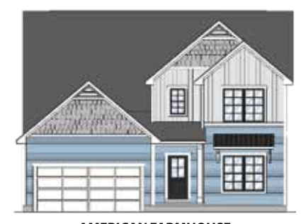
AMERICAN FARMHOUSE 4-Bedroom elevation shown with optional canopy roof.