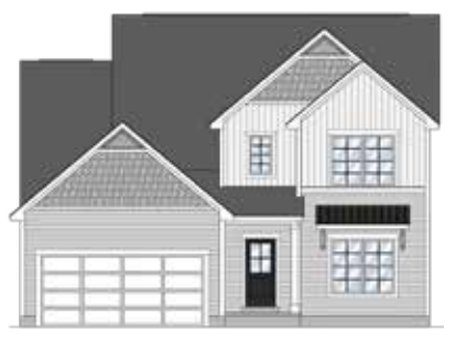
AMERICAN FARMHOUSE 3-Bedroom elevation shown with optional canopy roof.

AMERICAN FARMHOUSE elevation shown with 3 bedrooms and optional canopy roof.